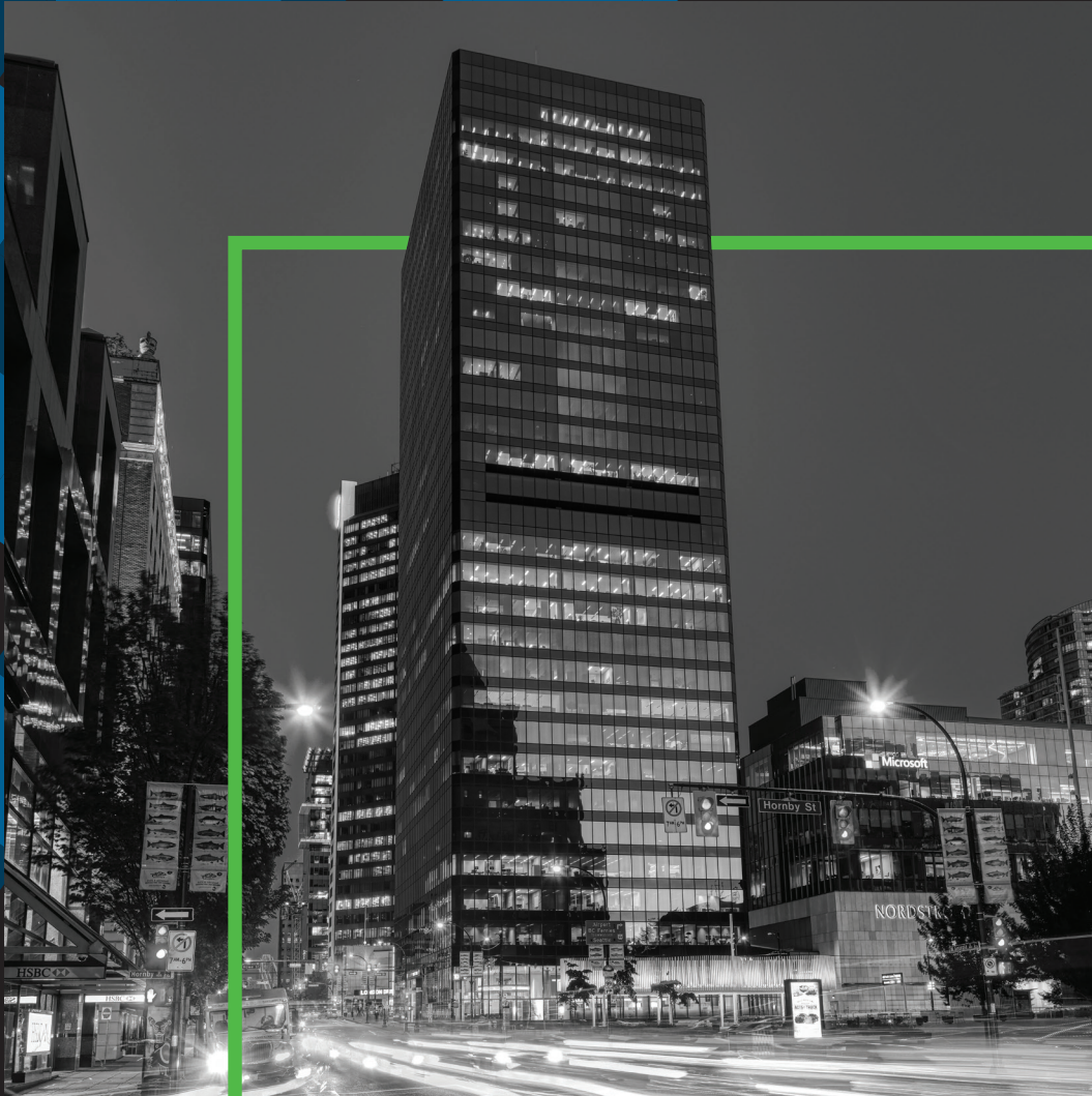
700 West Georgia Street, Vancouver